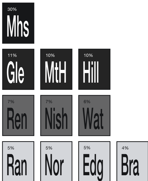
Discretionary Grant Distribution by School

The largest share of discretionary grant funds were issued to projects at Montclair High School, 30%, which also enrolls a third of Montclair’s students. Applicants representing Glenfield Middle School, Mt. Hebron Middle School, and Hillside each received roughly the same percentage of grant monies, 11%, 10%, and 10%, respectively. The remaining 39% of discretionary grant funds were distributed for projects at the rest of Montclair’s schools as follows: Renaissance Middle School and Nishuane (7% each); Watchung School (6%); Rand Family School, Northeast International School, and Edgemont Montessori (5% each); and Bradford Academy (4%).